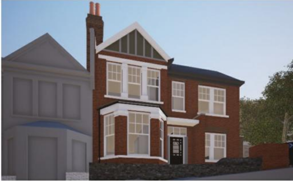
Visual impression of the proposed frontage.