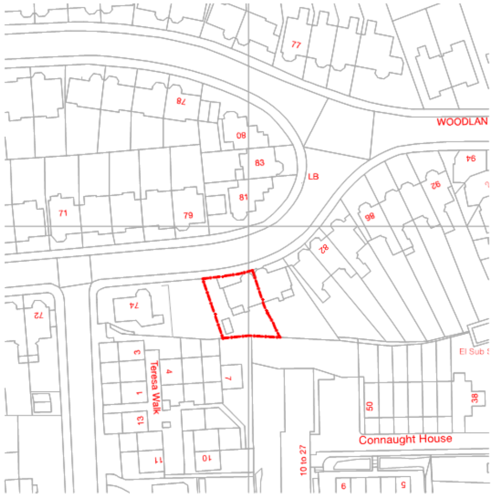
Site location plan