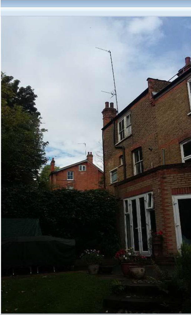
Site photo – rear of the site, (photo taken from neighbouring no. 78 Woodland Gardens)