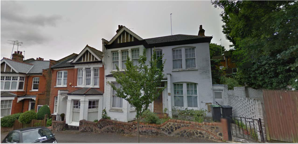
Site photo – frontage of current dwelling on site