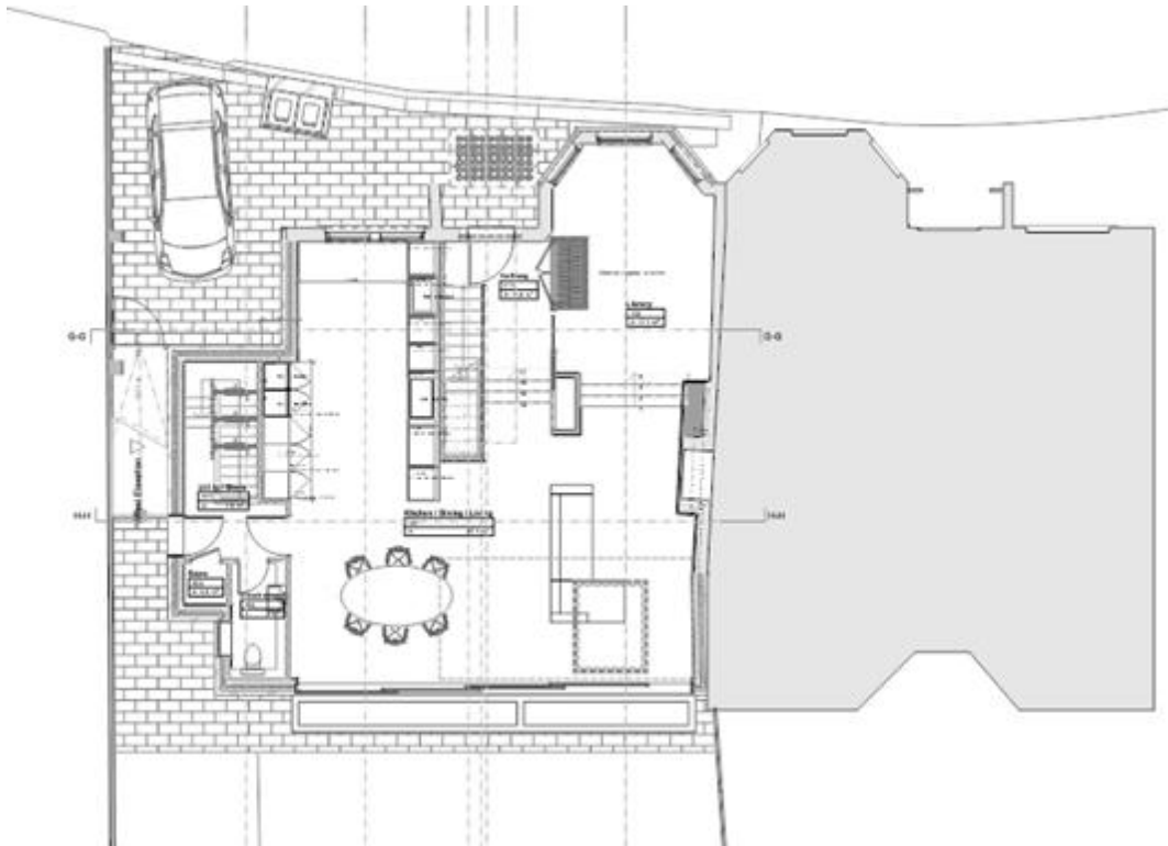
Site layout/ Ground floor